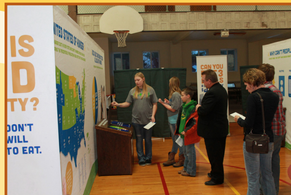
Participants learn about domestic hunger at the Clay-Central-Everly Hunger Summit

• Identifying teachers and nonprofit leaders who have facilitated successful collaborations in the past and learn from their successes and failures. Clay-Central/Everly Hunger Summit was inspired by the students’ experiences at the national FFA conference last October, and they were able to learn from FFA’s network as they planned their event.