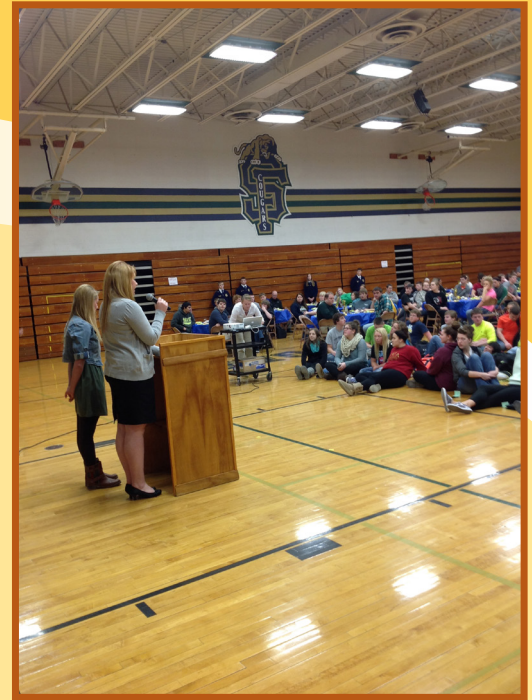
Organizers address their peers at a school-wide Hunger Banquet in Sumner-Fredericksburg

Students at Sumner-Fredericksburg raised $250, which was donated to Oxfam America's global hunger relief efforts and to the local Fayette County Food Shelf, which is recovering from a fire. The community was supportive, and funds to cover the cost of food at the Hunger Banquet were donated by the first person whom the students approached.