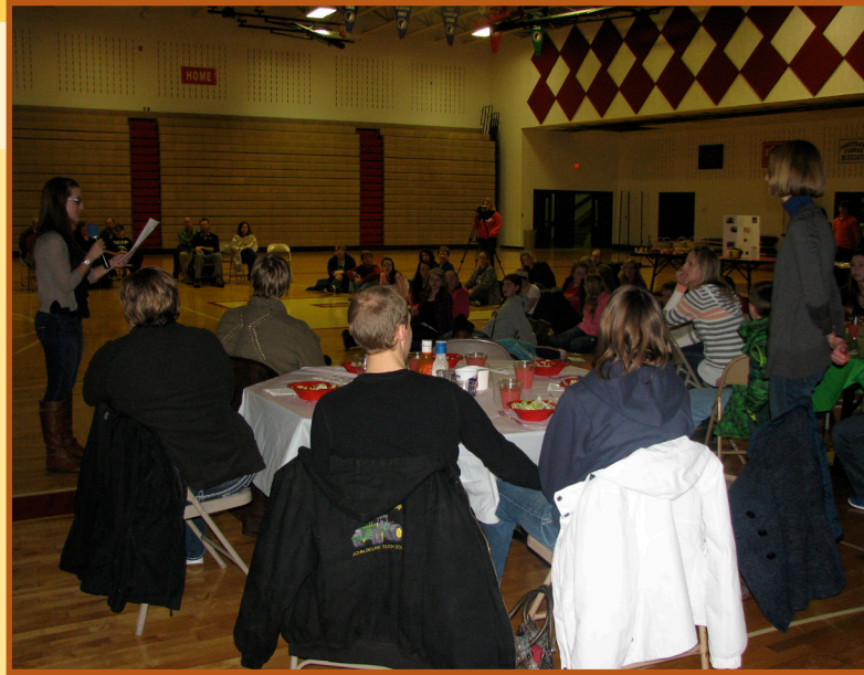
Participants at a student-led community Hunger Banquet in Boone

An important contributor to the success of the Boone Community Hunger Banquet was the emphasis on partnerships. Boone high school student-organizers worked closely with Outreach, Inc., and their decision to mentor eighth grade students supported the middle school's service-learning and citizenship curriculum.