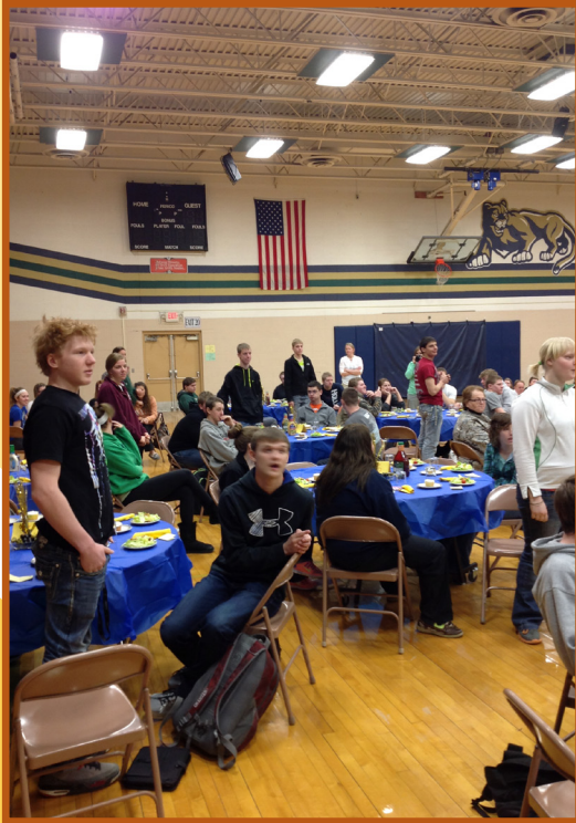
Students share a meal at a school-wide Hunger Banquet in Sumner-Fredericksburg

Recommendations for encouraging high school students' interest in hunger and supporting them as they take action include: