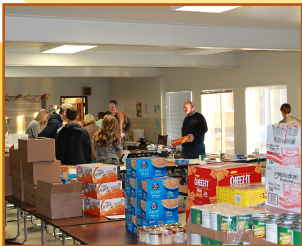
Organizers sort donations the at Clay-Central-Everly Hunger Summit

• Designing collaborations so that they further the top priorities of each partner. A successful collaboration makes the academic work of students more relevant, raises the profile of local nonprofits, and demonstrates local businesses’ commitments to corporate citizenship. Clay-Central/Everly students were sensitive to the priorities of businesses and nonprofits by involving ISU Extension and Outreach, the Clay County Cattlemen, the local food pantry, and the CC/E FFA chapter as workshop leaders, and by partnering with Elanco’s existing #Feedthe9 initiative.