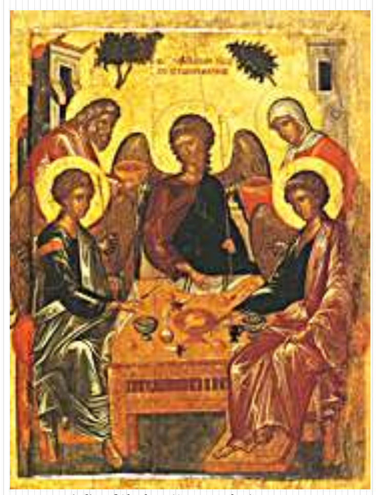
Hospitality of Abraham (Cretan, 15th c.)