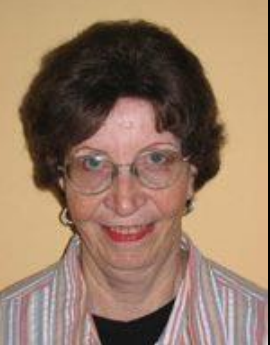
Healthy Animals, Healthy